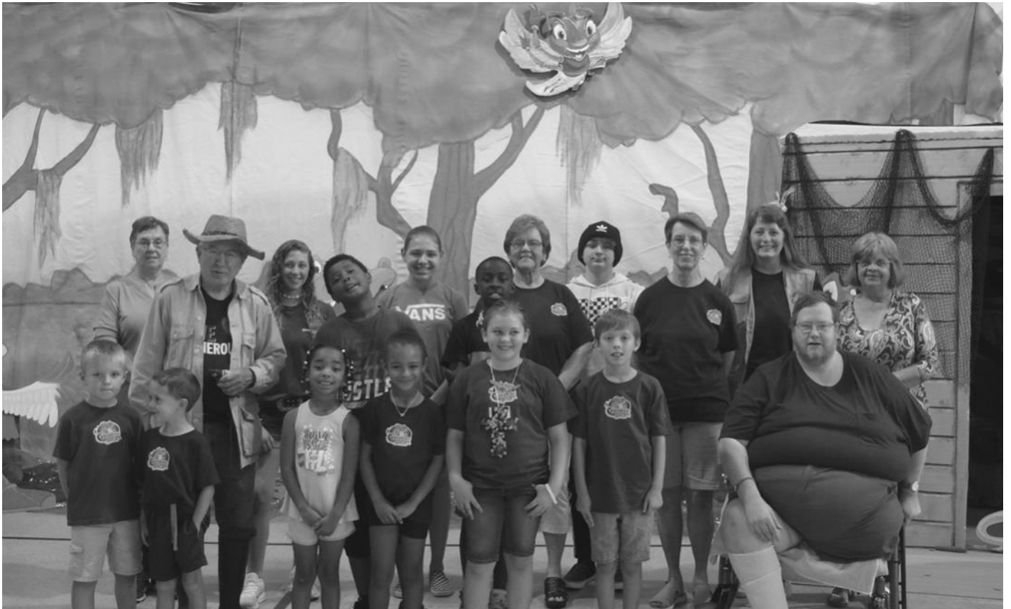
2019 Vacation Bible School